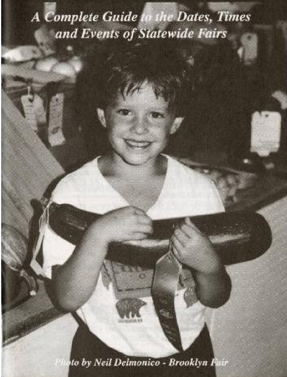
Brooklyn Fair

A Complete Guide to the Dates, Times and Events of Statewide Fairs